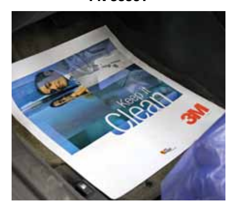
Heavy duty construction resists tearing Treated to resist moisture