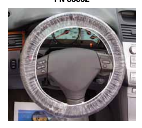
Elastic conforms to steering wheel Universal size fits all steering wheels