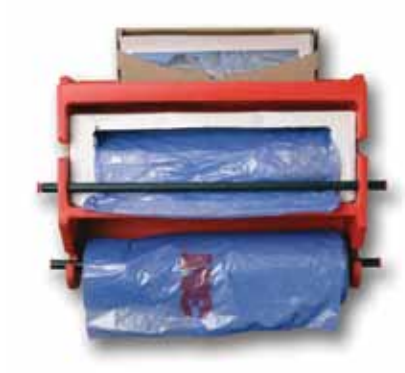
Wall Mount Interior Protection Product Dispenser